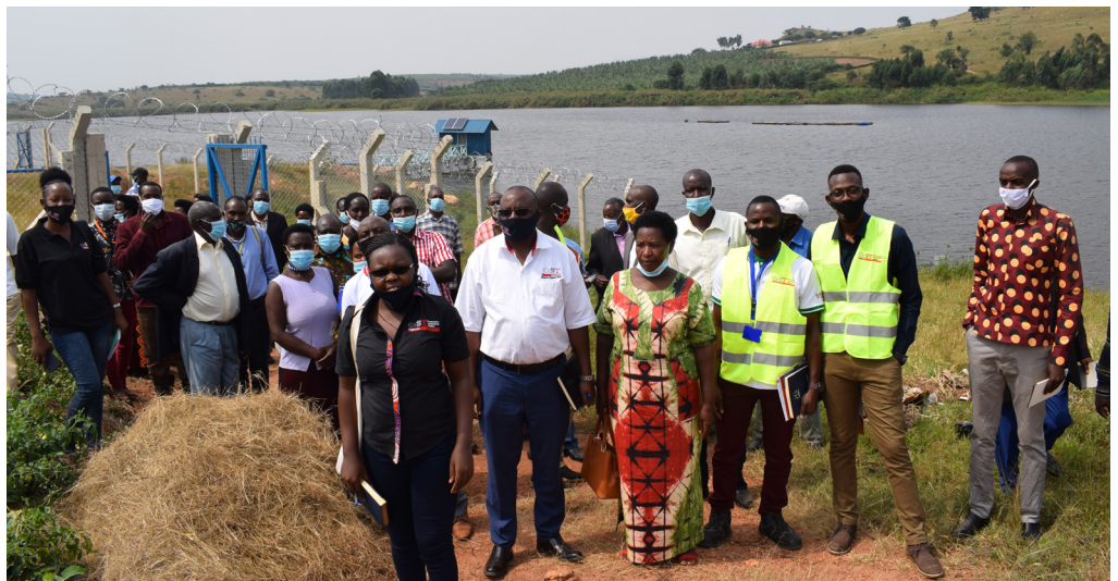
A CoST site visit to Mabira dam

Meanwhile in Mabira, citizens used the platform offered through the baraza to request that the Ministry extend water further within the community. This led to a firm commitment from the government to extend water across an additional 12 acres of land, covering 200 farmers in total, by 2025. Once this is done, the benefits recounted by farmers in increased production, employment and income will be felt by communities across these 12 acres.