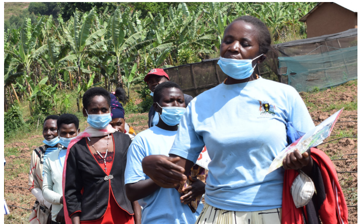
Female community members speak out at the Nyamihanga baraza

In the farming communities of Mabira and Nyamihanga in Uganda, the start of the dry season brings with it lower production levels for farmers, impacting on their take-home pay and food supply for families. Agricultural production plays a key role in the local economies of both localities: in Mabira, this is centred around cattle rearing and growing banana crops, whilst in Nyamihanga – located in one of the major ‘bread baskets’ of the country - farmers grow a variety of vegetables including potatoes, cabbages and aubergines. Lack of access to water during the dry season had critical impact on the viability of crops and wellbeing of livestock.