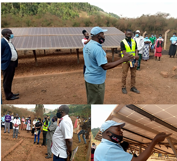
Nyamihanga solar-powered irrigation scheme

irrigation scheme. However, project implementation has not been plain sailing and a lack of stakeholder engagement impacted the maintenance and efficacy of both projects delivered.